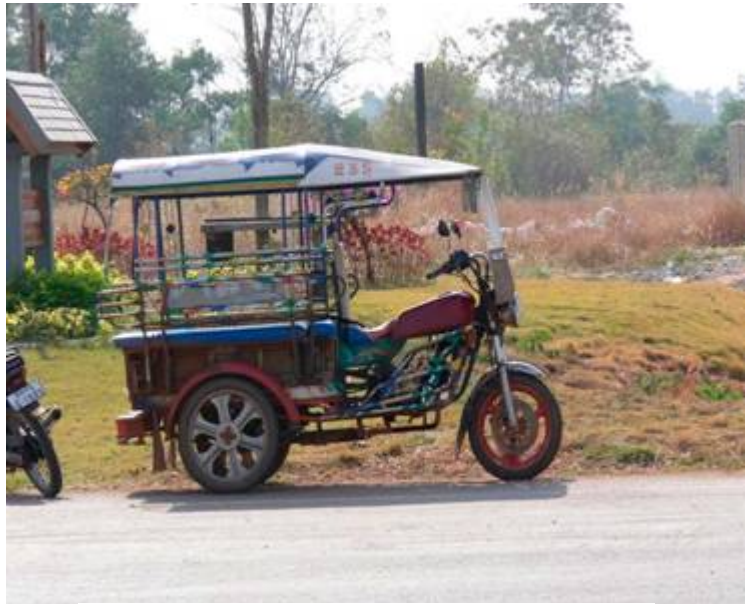
A “tuk-tuk,” a motor bike-driven taxi

to stay and shown around the town by local people from the office.